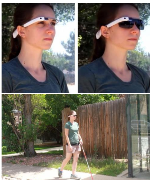
Figure 2: In Profita et al.'s study [18], HMD use was seen as more socially acceptable when there were (top right and bottom) visual indicators that the wearer had a disability (i.e., wore dark glasses and held a white cane) than when (top left) no visual indicators were present.

This conclusion raises an important tension in that, as discussed above, individuals with disabilities can be sensitive to devices that draw unwanted attention to their disability [19]. How can HMDs for assistive purposes be employed in a way that will allow the wearer to disclose that purpose, but only when desired?