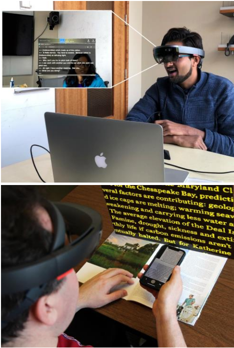
Figure 1: Examples of HMDs to support accessibility: (top) real-time captions for people who are deaf and hard of hearing [6] and (bottom) visually enhancing information (e.g., magnifying, increasing contrast) for people with low vision [20].